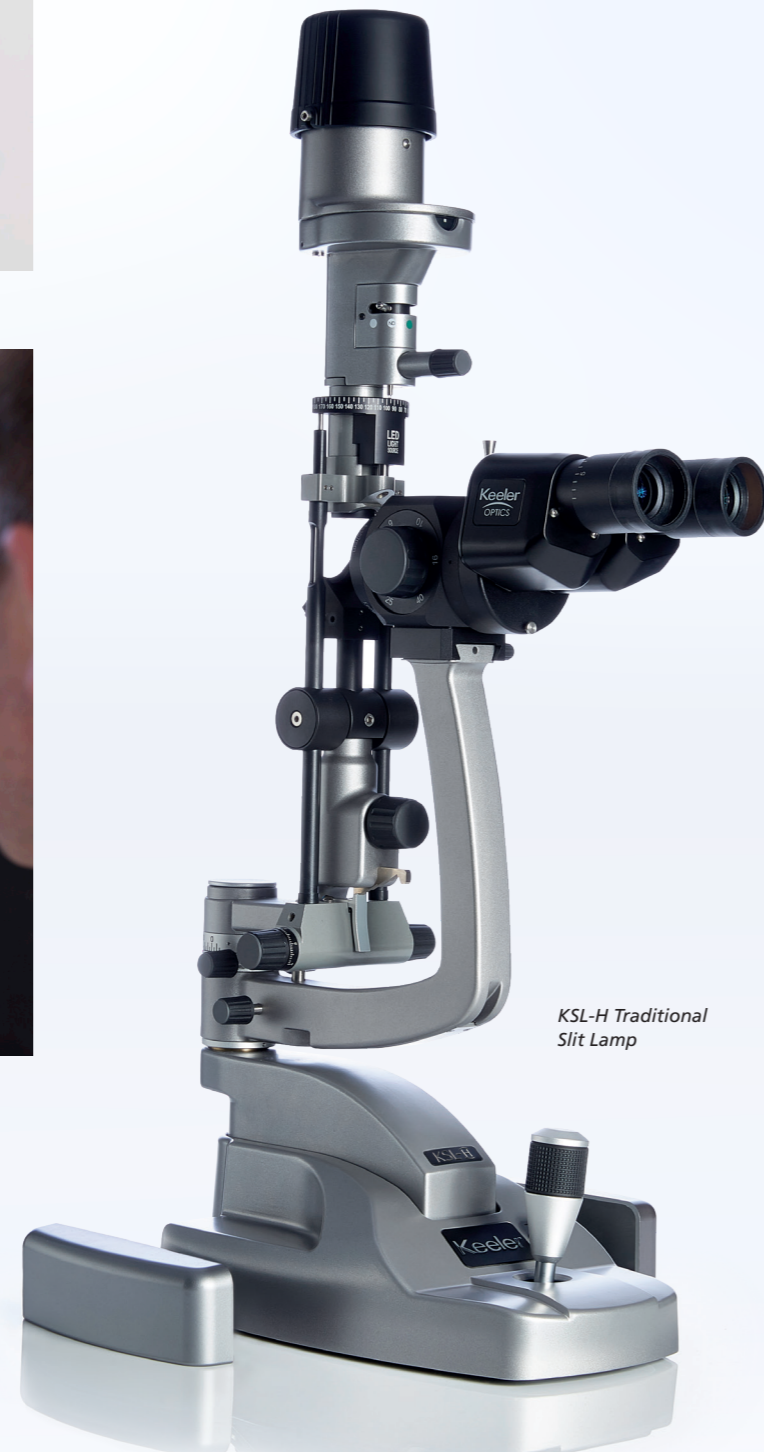
KSL-H Traditional Slit Lamp