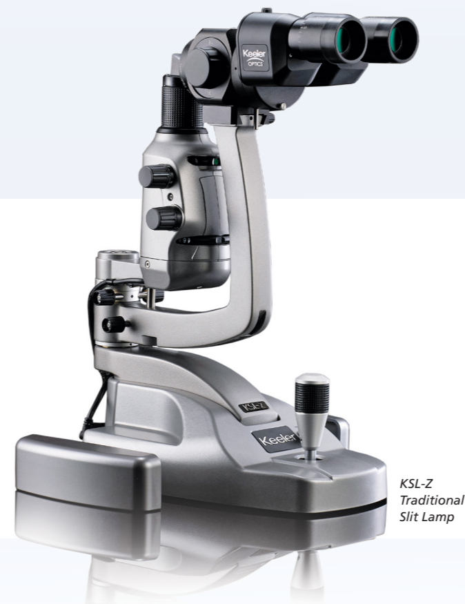
KSL-Z Traditional Slit Lamp

Available in Traditional, Digital and Digital Ready and with a 3 or 5 step magnification.