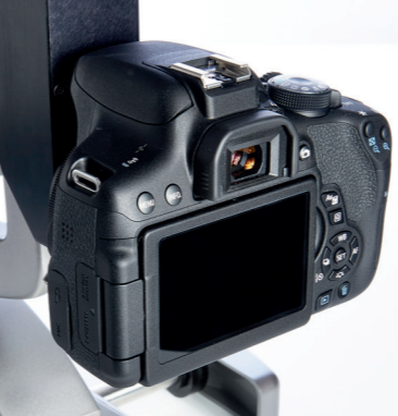
KSL-Z Digital Ready Slit Lamp with camera attachment

Lower Illumination 5 step magnification (6x, 10x, 16x, 25x, 40x) Digital Slit Lamp 3 megapixel: 2056 x 1542 USB 3 camera Kapture software