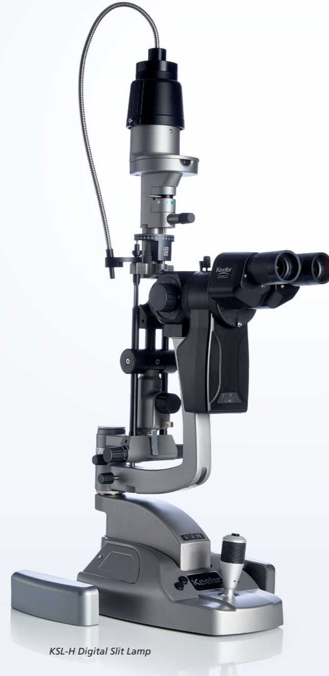
KSL-H Digital Slit Lamp