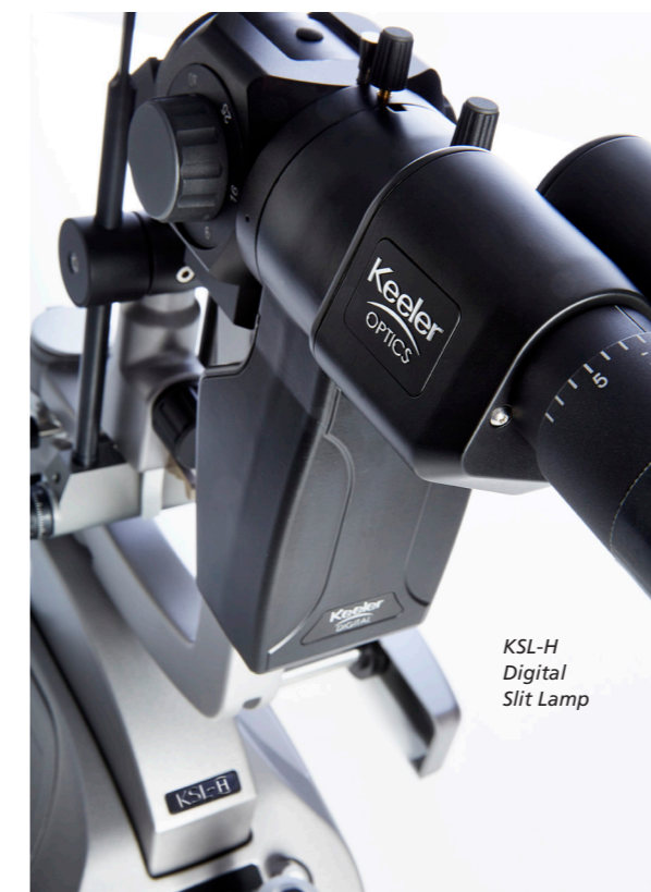
KSL-H Digital Slit Lamp

Available add-ons: digital camera, Kapture software